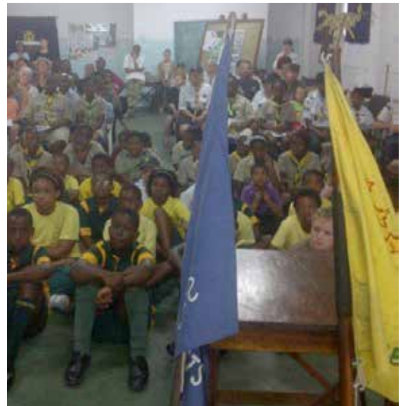
A packed 1st Richards Bay scout hall gather for BP Sunday.

You can surely feel very proud of these wonderful Scouts and their Leaders. We hope to see them again in the very near future and look forward to establishing a lasting Scouting relationship with them.